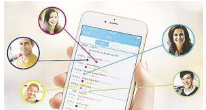
Cozi, a family organization app, allows users to keep track of calendar dates, appointments and events.