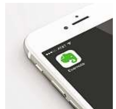
The Evernote app icon.

I guess it's time for me to retire my old-school paper calendars!