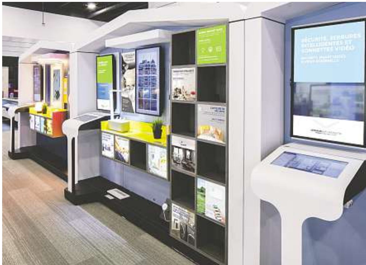
A view of the smart-home display at the Best Buy store, 470 Ste-Catherine St. W.

"Security cameras, doorbells, alarms and devices that help with securing your home are also very popular," Jaffer said. "These prod-