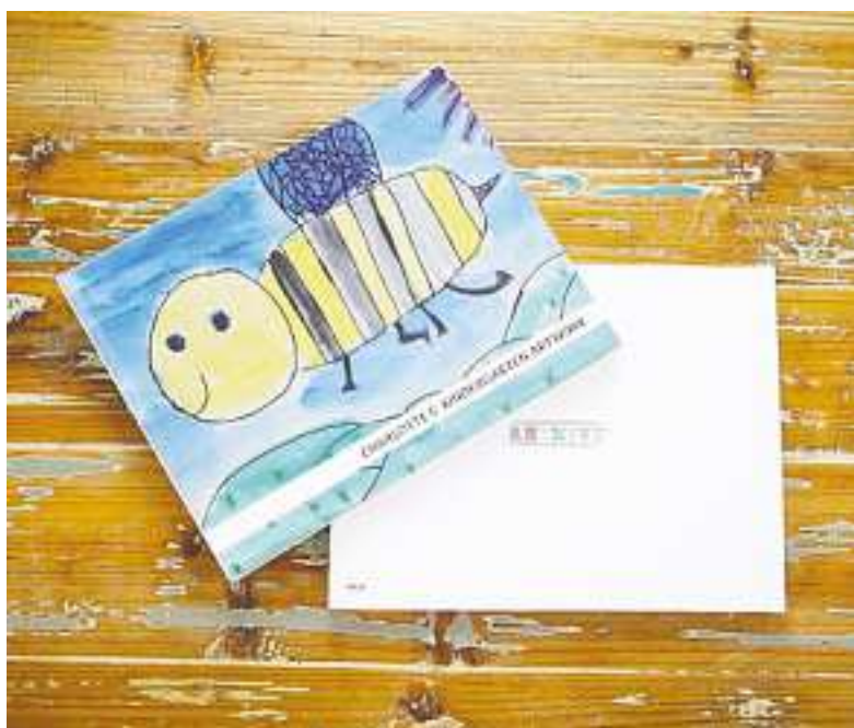
Artkive app allows a parent or teacher to create a hard-copy art or photo book that children can keep.